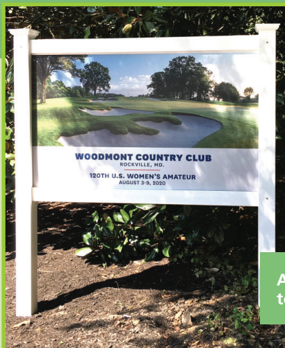
A sign at the 2019 Women's Amateur tells everyone who the host will be next year.